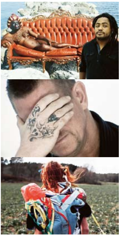
From top to bottom: A Kind of Paradise, The Samurai Case, She Male Snails