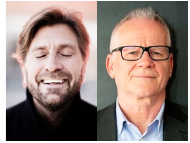
Ruben Östlund and Thierry Frémaux.

Accessible to Nordic Film Market participants. TV Drama Vision, Industry PRO and VIP accreditation are subject to availability.