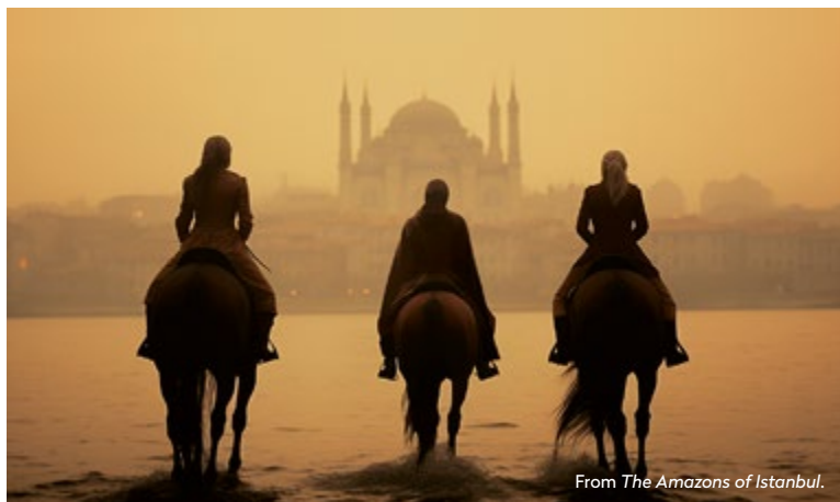
From The Amazons of Istanbul .